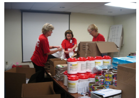
MRC volunteers preparing H1N1 vaccination kits

Thank you so much for this opportunity to volunteer for the Health Department. It's my third week and I'm really enjoying it. A lot of nice people at the Tarpon Clinic! I already look forward to seeing everybody when I go in. They've made me feel very much at home. I am getting to use my "skills" and I really enjoy that. It's good to have some structure again in my life and a sense of purpose. I like it most when things are really busy. They may not, but I sure do!! I am very proud to be doing this and I really do appreciate every moment of it. Thank you again!