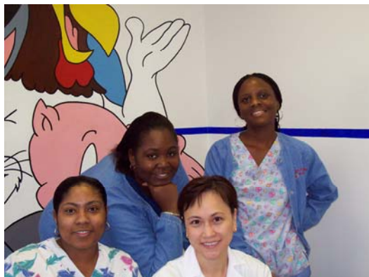
St. Petersburg Pediatrics 54 TH Avenue South Staff

A public health nurse is stationed at the pediatric office and sees the moms during well-baby care visits at the clinic.